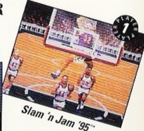
Slam 'n Jam '95™

SPECIAL BONUS INCLUDES 3DO STORAGE MANAGER UTILITY